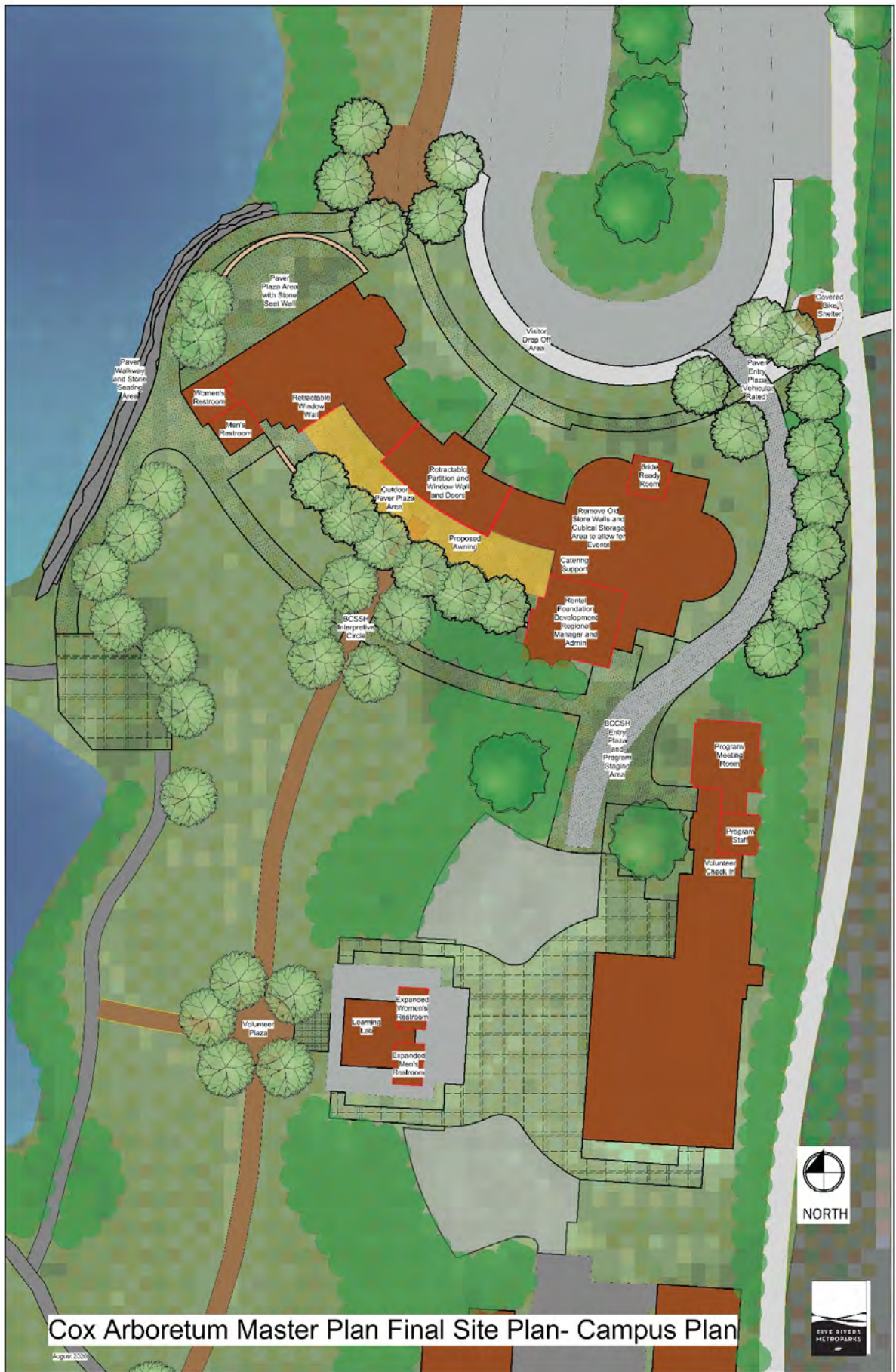
Cox Arboretum Master Plan Final Site Plan- Campus Plan