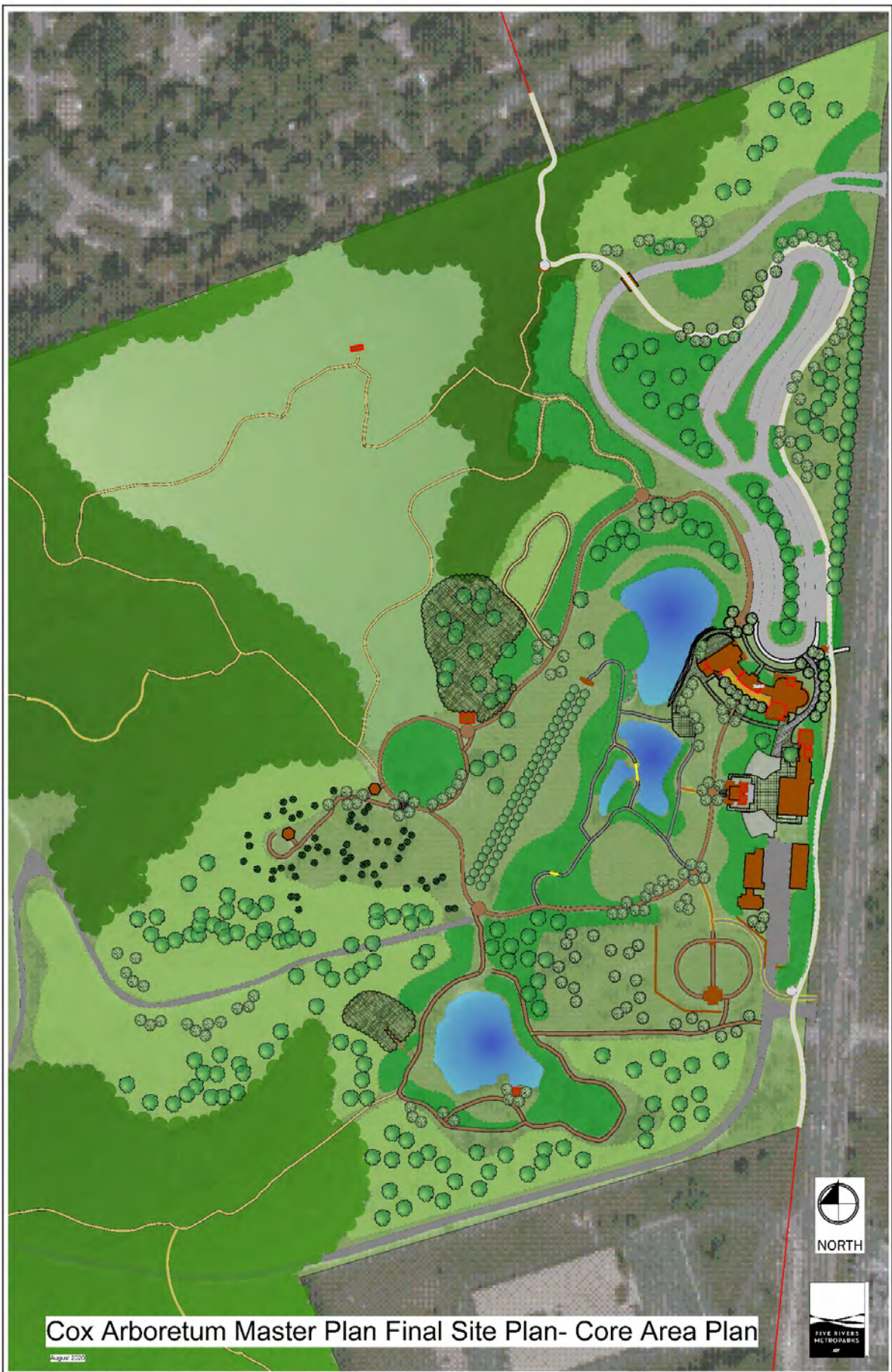
Cox Arboretum Master Plan Final Site Plan- Core Area Plan