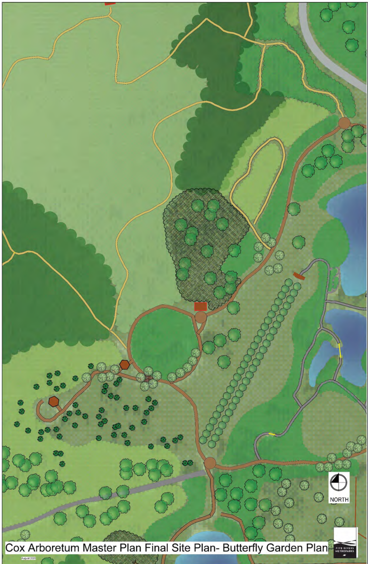
Cox Arboretum Master Plan Final Site Plan- Butterfly Garden Plan