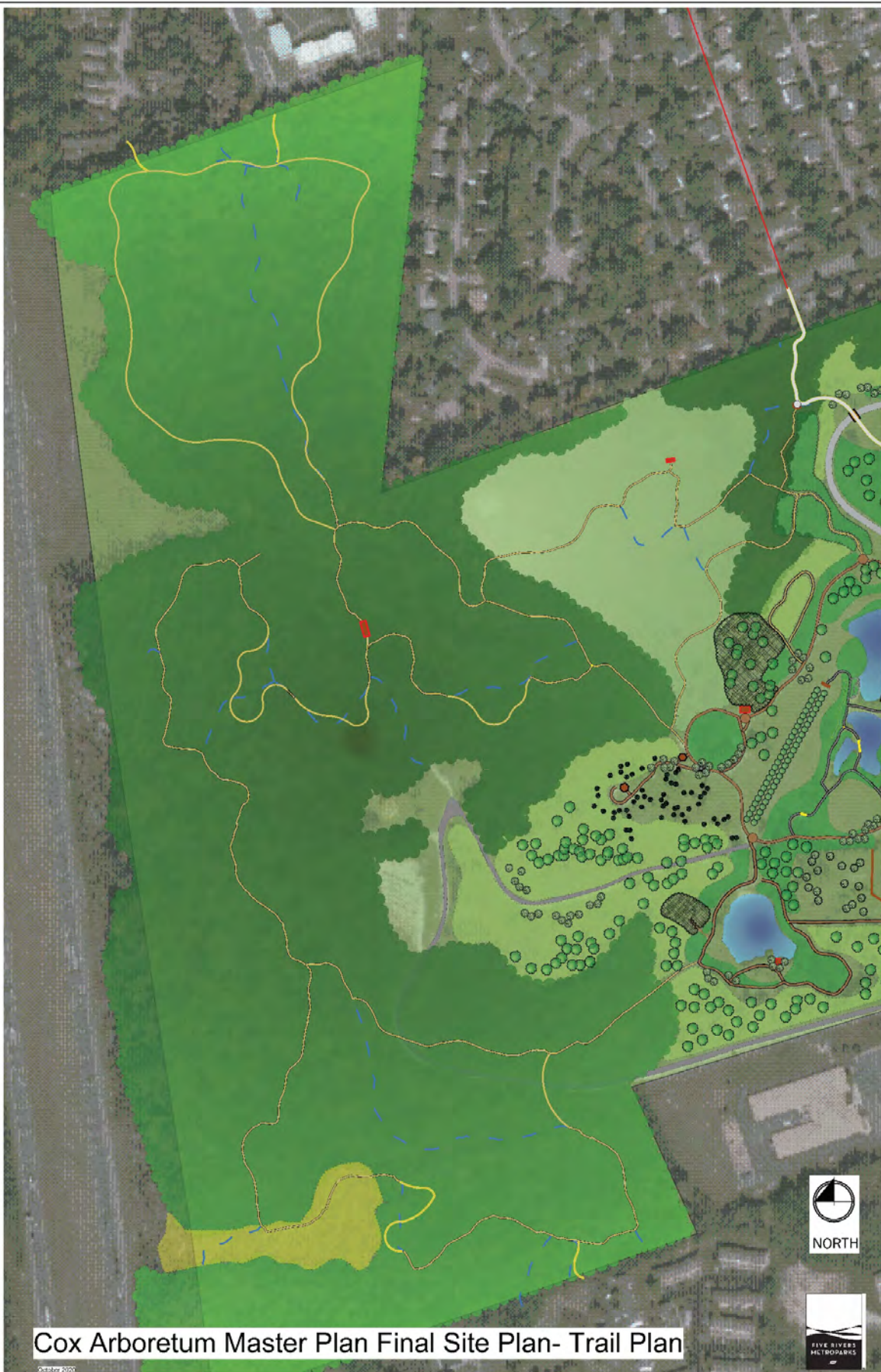
Cox Arboretum Master Plan Final Site Plan- Trail Plan