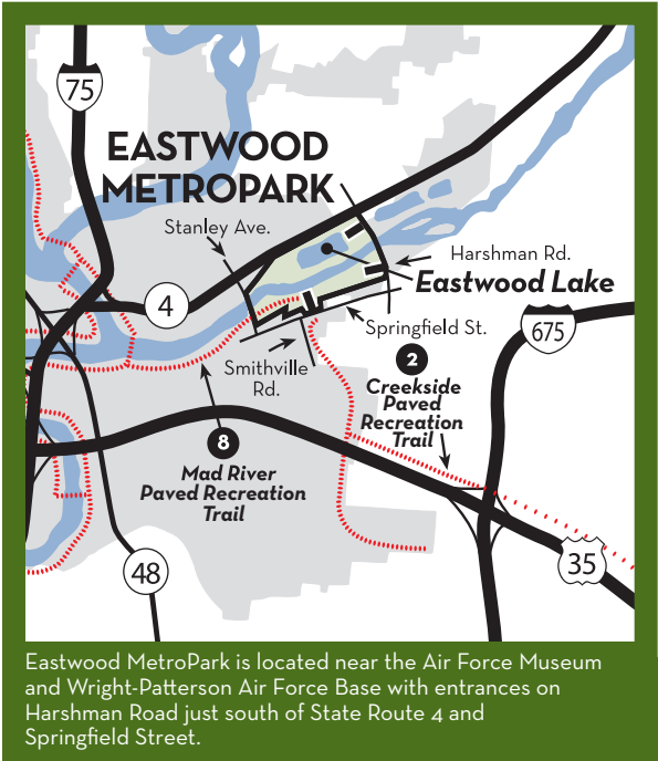
Eastwood MetroPark is located near the Air Force Museum and Wright-Patterson Air Force Base with entrances on Harshman Road just south of State Route 4 and Springfield Street.