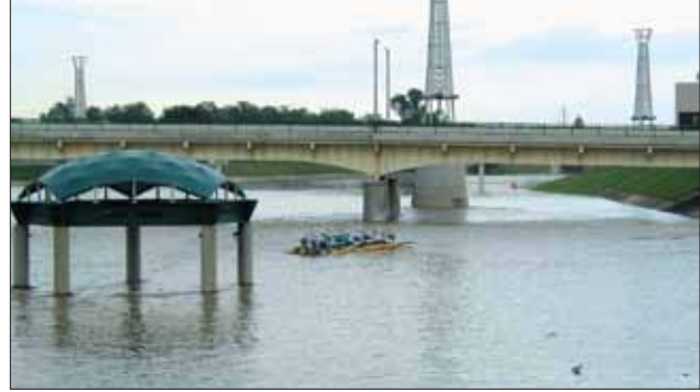
Paddlers should not boat on swollen rivers and streams like this high water on the Great Miami River in downtown Dayton.

Recreation on rivers and streams can be relaxing or thrilling, but it should always be safe. Water offers several real dangers, but with proper training, these hazards are easily managed. Boating safety classes that can teach you to handle water hazards are available around the state of Ohio. Contact the Ohio Department of Natural Resources at 1-877-4BOATER or watercraft.ohiodnr.gov for more information.