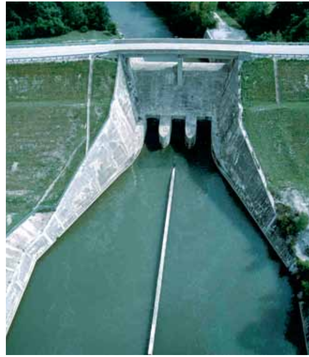
Huffman Dam near Wright Patterson Air Force Base is one of MCD's five flood protection dams.