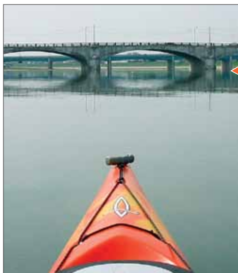
It looks calm and peaceful, but a low dam is only 200 feet beyond this boat, well in front of the bridge.

Unless you are trained in low dam rescues, never enter the water in an attempt to rescue someone trapped by a low dam. Immediately call for help, then throw a line from shore to the trapped person. Untrained rescuers should never approach the top of the dam or the backwash below the dam, even in a boat. The turbulence at the dam will easily capsize a boat.