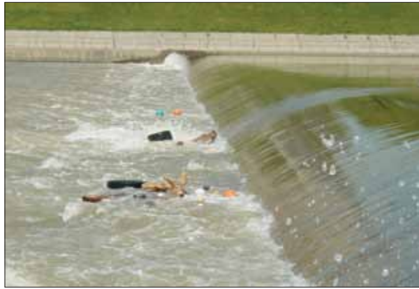
Low dams can be deadly and should always be avoided.

Low dams – like natural waterfalls – are deceptively calm and can be incredibly dangerous. Low dams may range from a 25-foot drop-off to a mere 6-inch drop-off. Water flowing over the dam forms currents that can trap objects and you. Backwash and re-circulating current can trap you back against the dam then underwater before you are pushed along the bottom only to be sucked back to the dam as you rise to the surface. This circulating motion repeats over and over again. The backwash currents may even suck you in if you approach too closely from downstream of the dam. The Mad River has many low dams, with additional low dams on its tributaries.