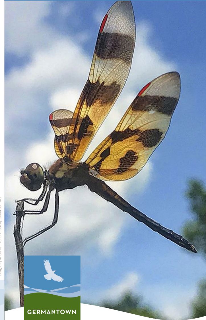
Dragonfly at Sunfish Pond

Printed in Montgomery County, with vegetable-based inks on 10% post-consumer waste paper at a Forest Stewardship Council-certified facility.