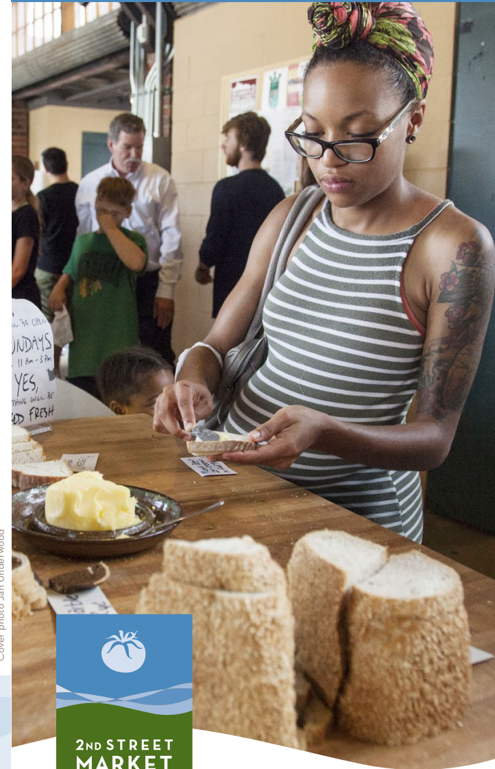
Cover photo Jan Underwood