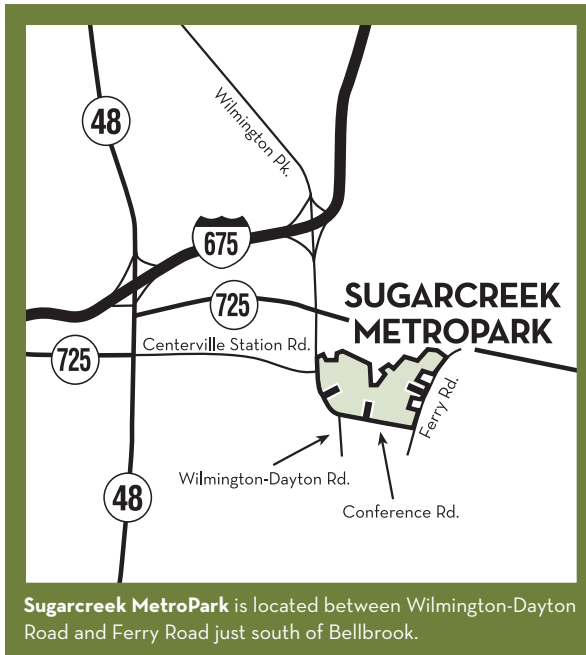
Sugarcreek MetroPark is located between Wilmington-Dayton Road and Ferry Road just south of Bellbrook.