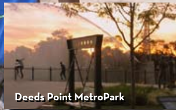
Deeds Point MetroPark