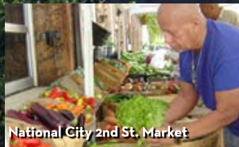
National City 2nd St. Market