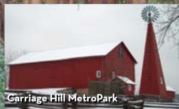
Carriage Hill MetroPark