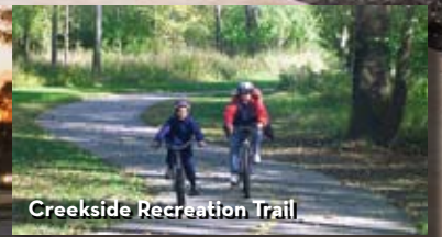
Creekside Recreation Trail