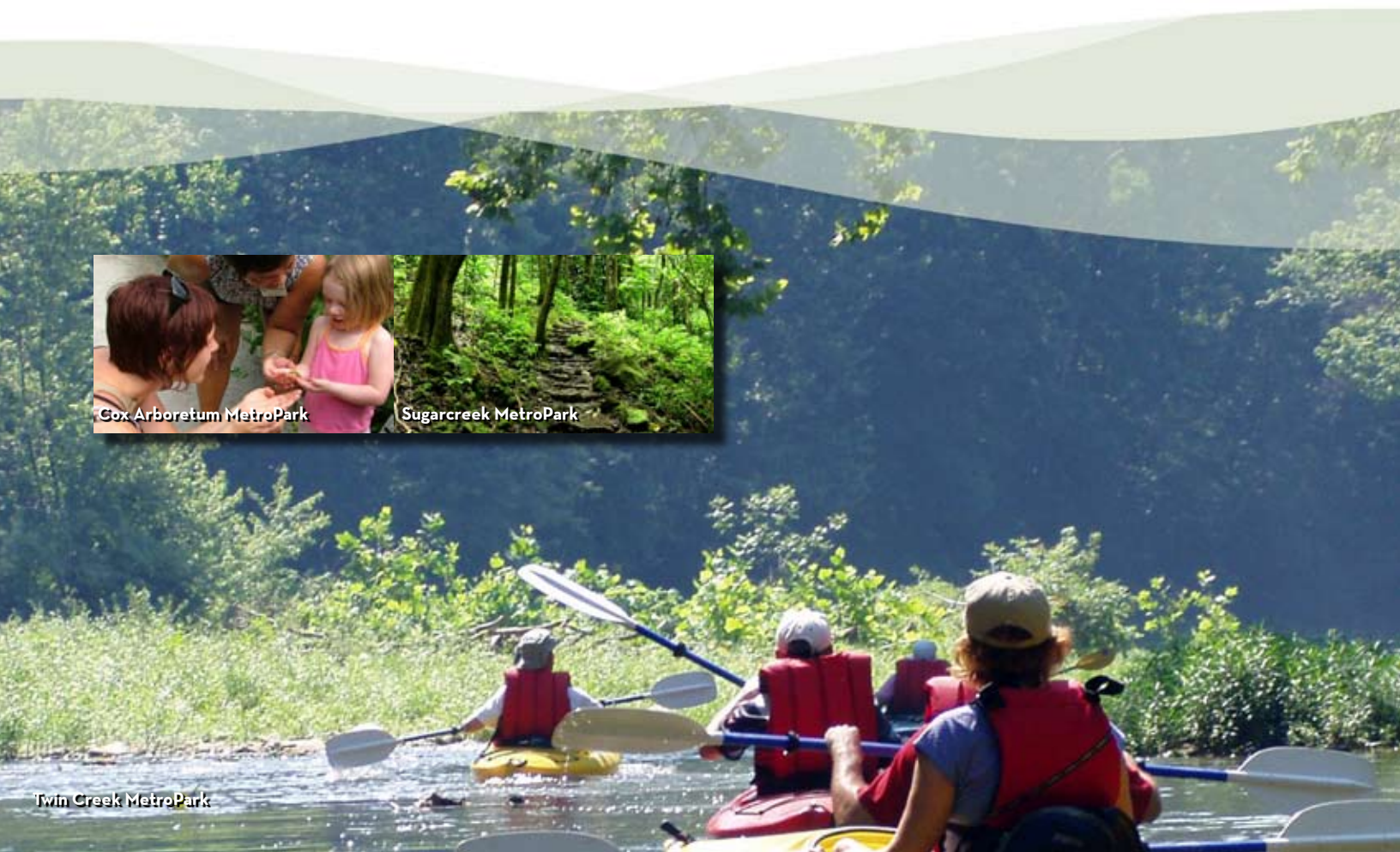
Twin Creek MetroPark